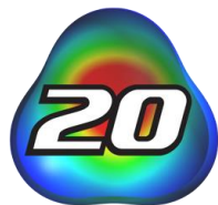
Spartan'20 (Win, Mac, Linux)